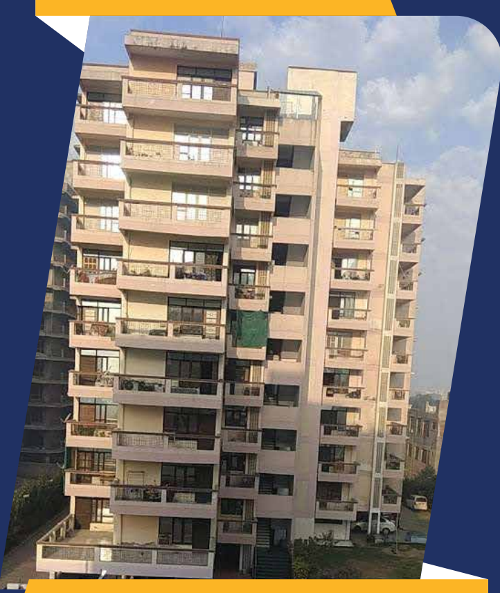
SECTOR 2 | FARIDABAD | HARYANA