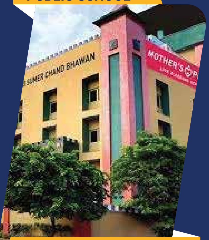
MODEL TOWN - III | DELHI ARCHITECT - SATYENDAR JAIN SWASTHYA MANTRI (AAP)